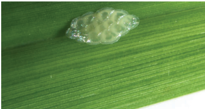
Figure 4. Tropical sod webworm egg cluster laid on grass leaf sheath.