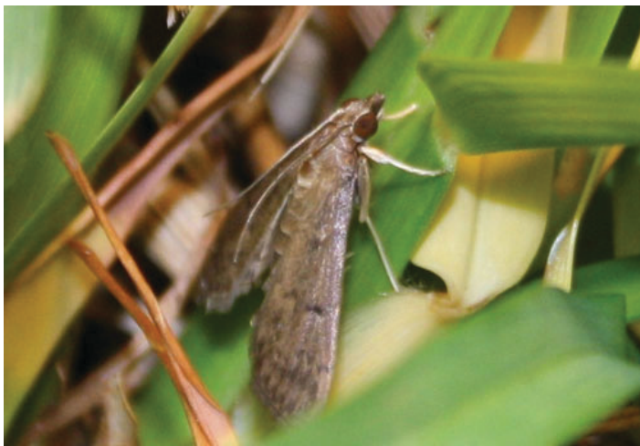
Figure 3. Adult tropical sod webworm resting in grass.