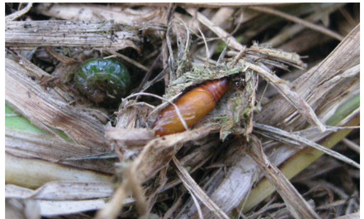
Figure 6. Pupa found in cocoon in St. Augustinegrass thatch.

The reddish brown pupae are about 8.5 to 9.5 mm long and 2.1 to 2.9 mm wide. The pupae are normally buried in the upper thatch.