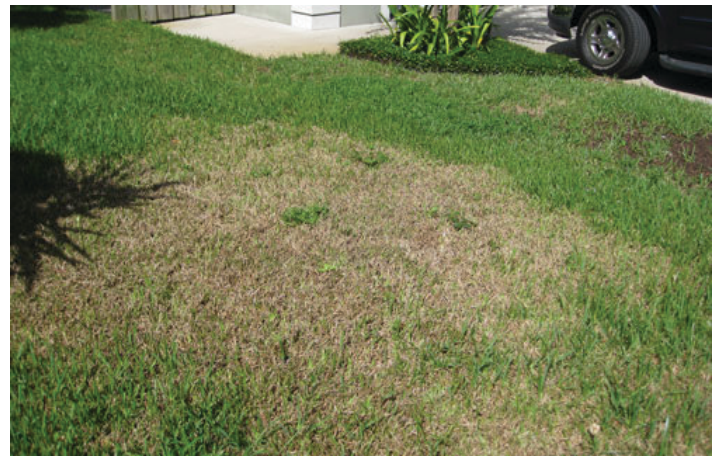
Figure 8. Tropical sod webworm damage to St. Augustinegrass lawn.