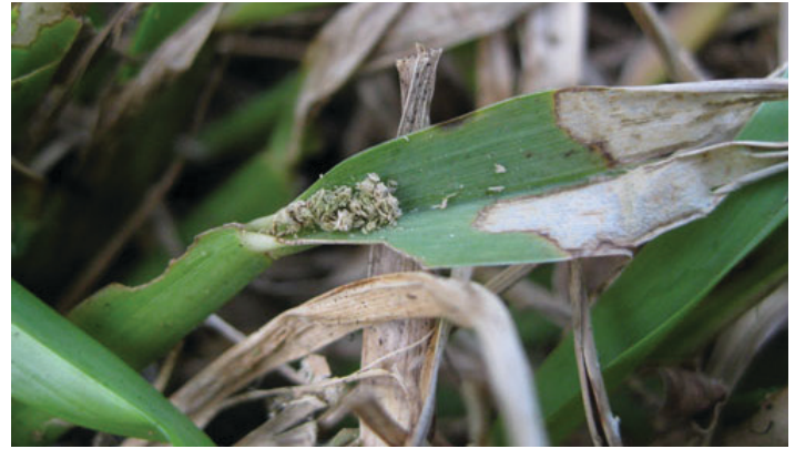
Figure 7. Window feeding on right caused by younger larval instars of tropical sod webworm.

are not too severe, but feeding damage causes yellowish and brown patches and often leads to the ingress of weeds.