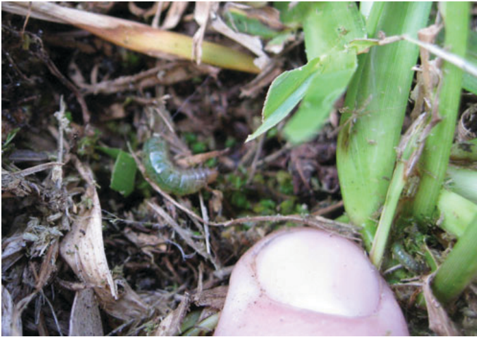
Figure 10. Mature tropical sod webworm larvae feeding in thatch.