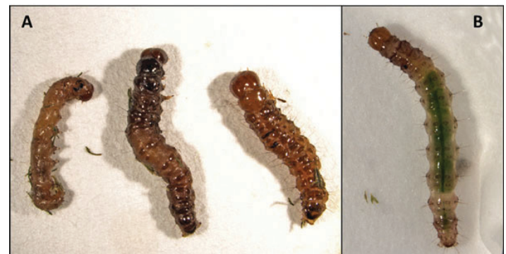
Figure 11. Tropical sod webworm larvae killed by an entomopathogenic nematode, Steinernema feltiae (A), and a healthy control larva (B).

Entomopathogenic nematodes (esp. Steinernema carpocapsae ) have been successfully tested against tropical sod webworms in Florida (Tofangsazi et al. 2014). Entomopathogenic fungi (esp. Beauveria bassiana ), and the bacterial-based insecticides Bacillus thuringiensis var. kurstaki and aizawai , and spinosad ( Saccharopolyspora spinosa by-product) may help control sod webworms without impacting beneficial species.