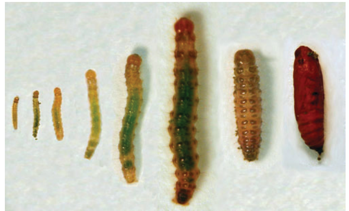
Figure 5. Tropical sod webworm larval instars, pre-pupae and pupa (L to R).

respectively. Average body length of each instar is 1.2, 2.7, 4.1, 6.0, 8.4, and 11.3 mm, respectively.