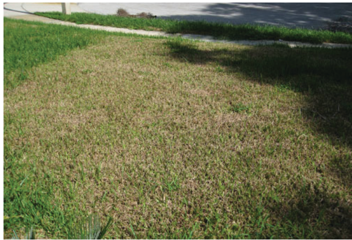
Figure 1. St. Augustinegrass residential lawn damaged by tropical sod webworm (foreground).

Tropical sod webworm larvae are destructive pests of warm season turfgrasses in the southeastern US, especially on newly established sod, lawns, athletic fields, and golf courses. Larval feeding damage reduces turfgrass aesthetics, vigor, photosynthesis and density. The first sign of damage is often caused by differences in grass height in areas where larvae are feeding. Tropical sod webworms are part of a pest complex of warm season turf caterpillars in Florida that include fall armyworm ( Spodoptera frugiperda ), striped grass loopers ( Mocis spp.), and the fiery skipper ( Hylephila phyleus ).