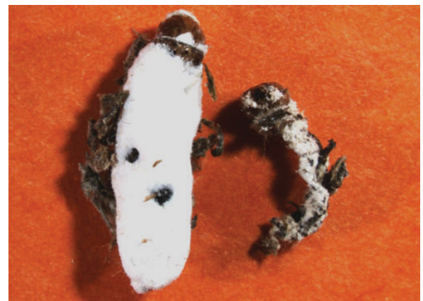
Figure 12. Tropical sod webworm larvae killed by Beauveria bassiana . The fungus is sporulating on the dead larvae.