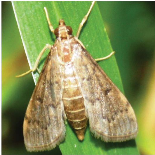
Figure 2. Adult tropical sod webworm.